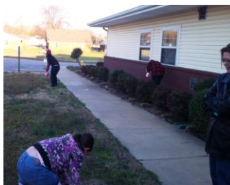
Hunting for eggs.