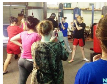
Learning defensive skills.